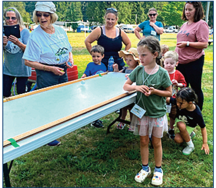
Above: The 4 to 6 year old campers & below a treasure is found at Heritage Camp

where their ancestors came from and wanted to know more about us. I think we were a success and I enjoyed myself.