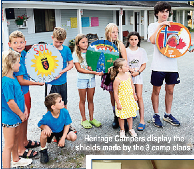
Heritage Campers display the shields made by the 3 camp clans.