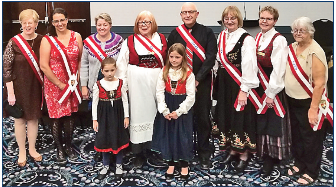
Our new District 7 Officers at the Convention held by Sleipner & Varden Lodges in May