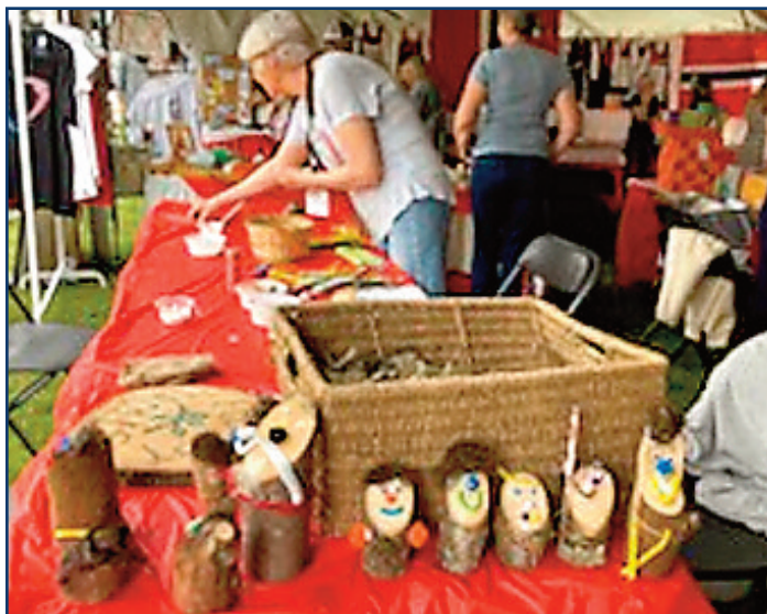
Norwegian House Society play table for children showing samples of Trolls they made at Midsummer Festival June 2024