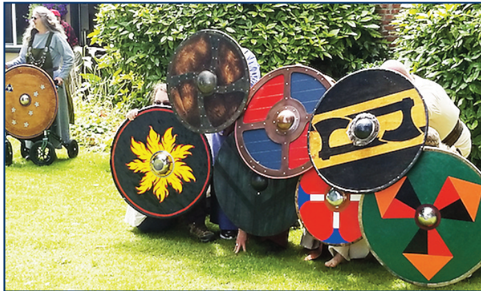
Viking Battle Shields at Border Festival. Members from Washington all came in full Viking gear

In today's world, we cannot take for granted our "open" border with the USA and this was a continued opportunity to let those who attended the Border Festival know who "Canadian" Sons of Norway members, are.